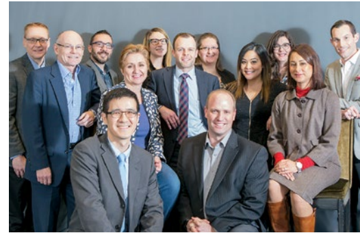
Panel of volunteer CPA judges.