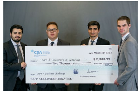
Students from the University of Lethbridge take home third prize.