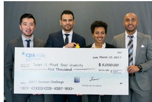
Students from Mount Royal University take home second prize.