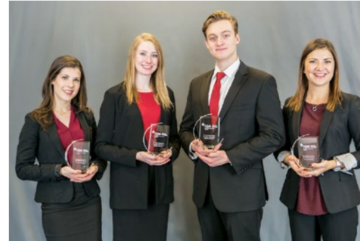
Students from University of Alberta take home first prize.