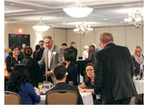
Post-secondary representatives from across Alberta networking at the 2016 Conference for Academics.

As per tradition, the conference day also included an interactive peer group discussion on topics of interest to accounting educators. Conference attendees were encouraged to meet with colleagues from various post-secondary institutions to share their thoughts and experiences on technology in the classroom, pedagogy, teaching management, teaching tax, preparing students for the CPA program, and accounting research.