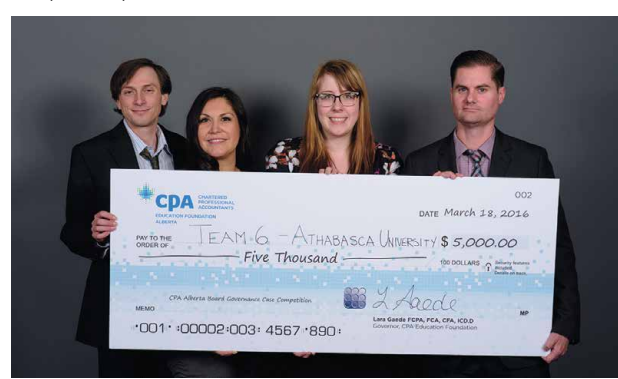
Students from Athabasca University take home second prize.