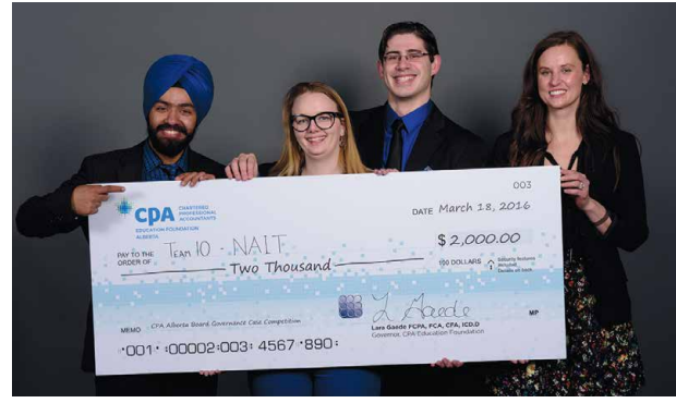
Students from NAIT take home third prize.