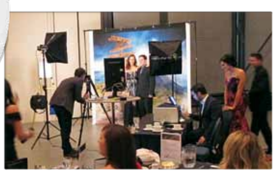
CA grads getting their photos taken in front of a unique, custom-designed photo booth at the CA graduation balls in Edmonton and Calgary in 2012. All proceeds from this initiative went towards the Paying it Forward fundraising campaign.