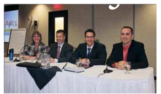
Panelists prepare for "Success in the classroom... Success in the Boardroom" discussion at the 2012 CAEF Conference for Academics (Red Deer).