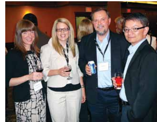
Guests at the Academic Conference