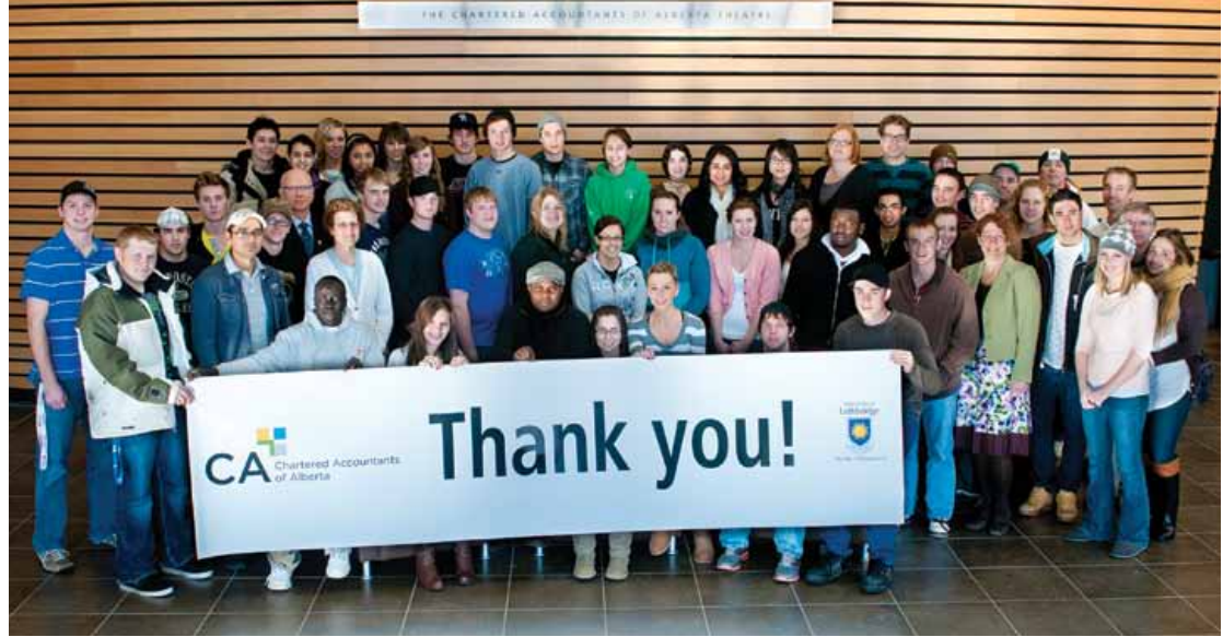
Students pose outside the Chartered Accountants of Alberta room at the University of Lethbridge's completed Markin Hall.