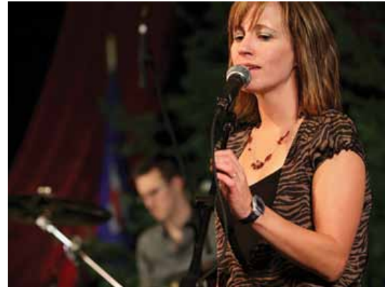
Guests enjoy the western-themed ICAA “Spur-tacular” held in September 2010 to celebrate the centennial of the CA profession in Alberta. The CAEF’s Paying it Forward campaign was officially launched at the Spur-tacular.