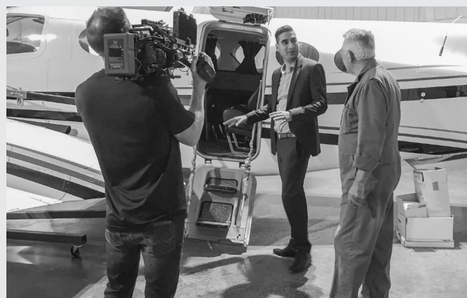
A look at what goes on behind the scenes for the CPA Smart video series.

In the fall of 2019, the CPA Smart video series was introduced to Albertans. The videos profile CPAs and the lessons they have learned through their careers about education, perseverance, and career growth.